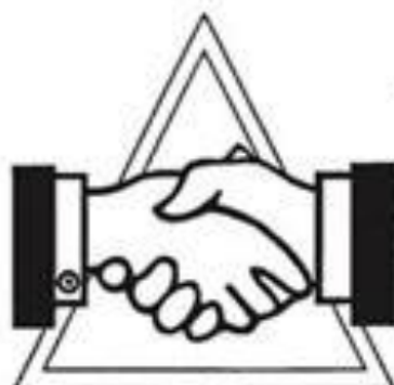
HANDS ACROSS THE TABLE

REGISTRATION AT DOOR - $30.00 PER PERSON