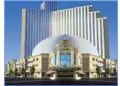
SILVER LEGACY RESORT