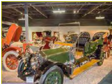
NATIONAL AUTOMOBILE MUSEUM