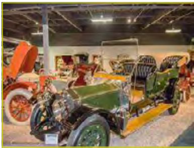
NATIONAL AUTOMOBILE MUSEAM