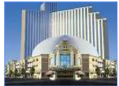
SILVER LEGACY RESORT