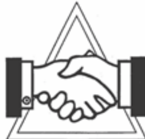
HANDS ACROSS THE TABLE

REGISTRATION AT DOOR - $30.00 PER PERSON