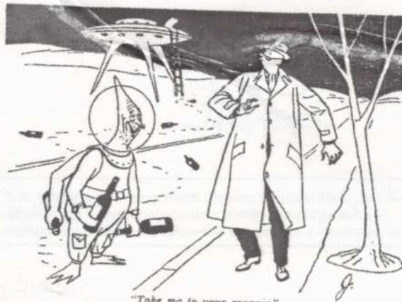
"Take me to your sponsor."

This guy comes into a bar and orders three separate shots of Irish whiskey. He downs one, engages in casual conversation with the bartender, eventually finishing the other two. This goes on for a few days and the bartender finally says, "You know, I can put all three shots in one glass for you." The other gentleman replies, "No, I prefer it this way. See, I'm very close to my two brothers. They're both in Ireland now and this represents a drink for each of us. This way I can be closer to them and feel like we are all having a drink together." The bartender agrees and continues to set them up as requested. This goes on for several months, and then one day, the guy orders two shots. Well the bartender begins to worry that maybe something has happened to one of his brothers. He's gotten to know this guy over the month and finally feels it necessary to ask. "Is everything alright?" the bartender asked. "What do you mean?" replied the gentleman. "Well," the bartender said, "all these months you've ordered three drinks. Now you've only ordered two. Something didn't happen to one of your brothers, did it?" "No," the gentleman replied. "They are okay. It's just that I quit drinking."