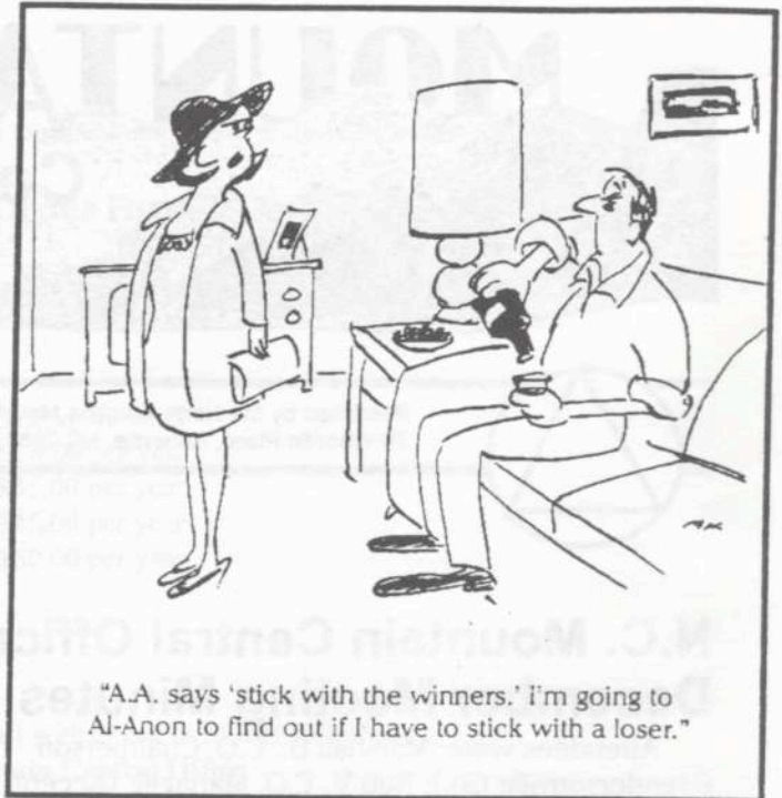
"A.A. says 'stick with the winners.' I'm going to Al-Anon to find out if I have to stick with a loser."

Meeting Location Change: The Hendersonville