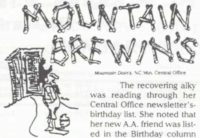
Mountain Doin's, NC Mtn. Central Office

The recovering alky was reading through her Central Office newsletter's birthday list. She noted that her new A.A. friend was listed in the Birthday column as December 26. But no