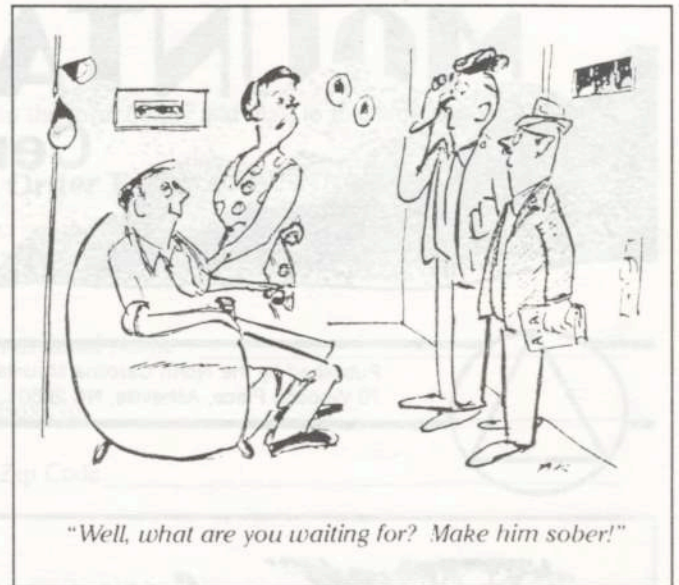
"Well, what are you waiting for? Make him sober!"