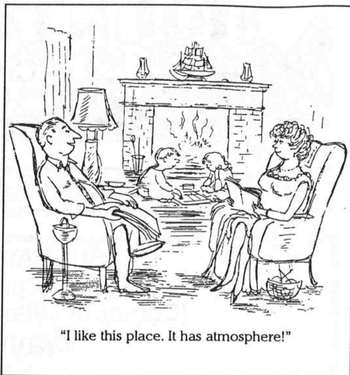
"I like this place. It has atmosphere!"

Meeting address change: The Sylva Mission Group continues to meet at its same location as published in the Where and When , but the street name has now been changed. What was formerly known as Church Street has now been renamed Finch Street.