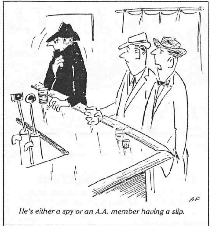
He's either a spy or an A.A. member having a slip.