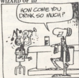
WIZARD OF ID